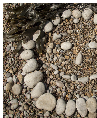
Figure 3: Pebbles as a smiley face

CHANCE AND NECESSITY. There are different ways in which 'chance' is used. Here White means not the sense of 'non-deterministic', or 'essentially probabilistic'. Rather, he uses the sense sometimes associated with 'contingency':