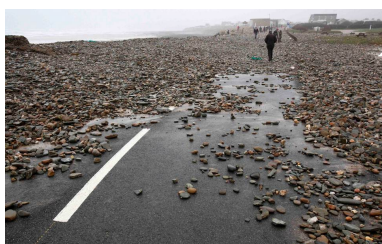
Figure 1: Random pebbles