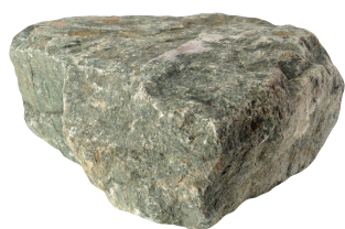
Figure 1: Unknown stone

PALEY'S ARGUMENT. Suppose I find a stone on a plain (Figure 1). It is uninteresting and absurd to ask why the stone happened to be there. Suppose, on the other we find a watch in these otherwise uninhabited surroundings (Figure 2). Suppose we are able to examine it. The complexity of its parts must convince us in its creation, convince us of a plan with which the watch was produced. Every part plays a small role in making the watch fulfil its overall purpose, which is, well, to show the time. Every part is so delicately arranged, in a non-obvious way, so as to convince us in the existence of a designer.