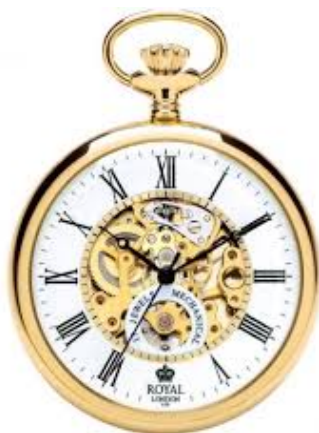
Figure 2: Paley's(?) watch